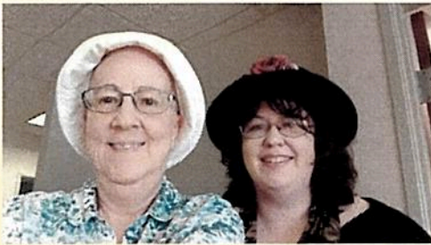
The Morgantown Office Enjoyed "Hat Day" on May 7, 2018.