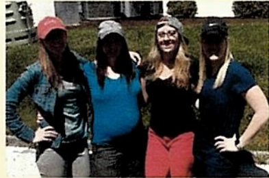
April was Autism Awareness Month